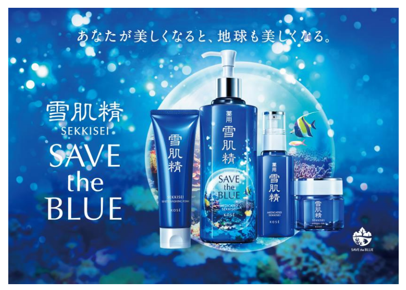
(Logo for SAVE the BLUE)